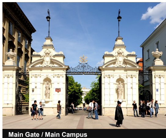
Main Gate / Main Campus